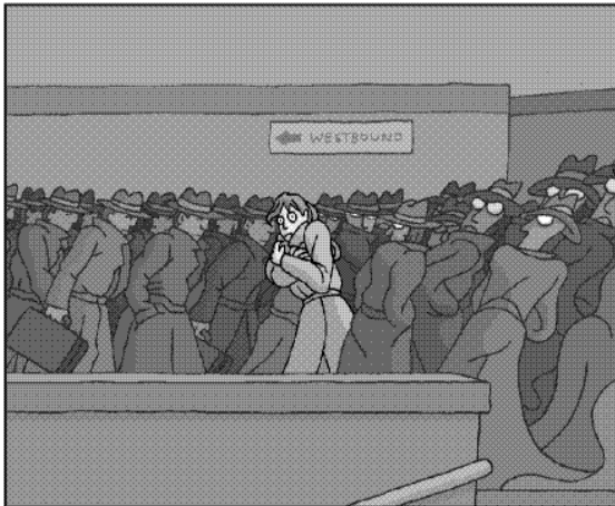
copyright © 2000 The Parking Lot is Full

Little-known Fact #839: There are only twenty-three people alive today, and you're one of them; everyone else you know just looks human to lull you into not searching for the other twenty-two. Lonely? You should be.